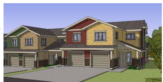
The Valley Pointe Project is located in Spokane Valley on East Appleway near University Road.

Don't currently qualify? We will work with you to fix credit issues and get you mortgage ready >>> Learn More!