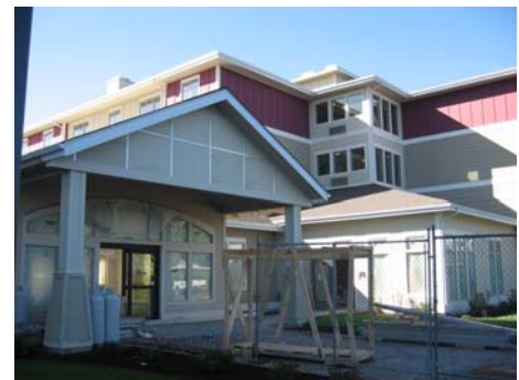
Lilac Plaza Retirement Community prepares for the grand opening of Lilac Terrace, a 50-unit addition.